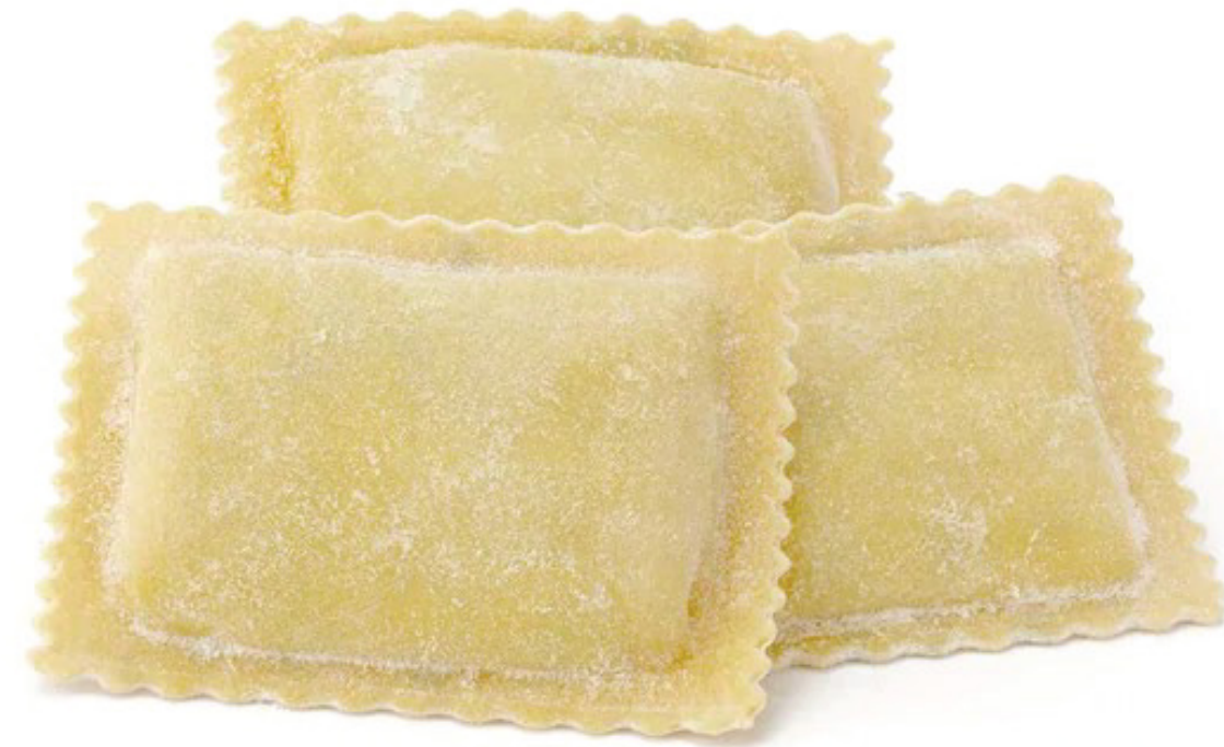
Eggplant & Ricotta Salata $13.99 lb