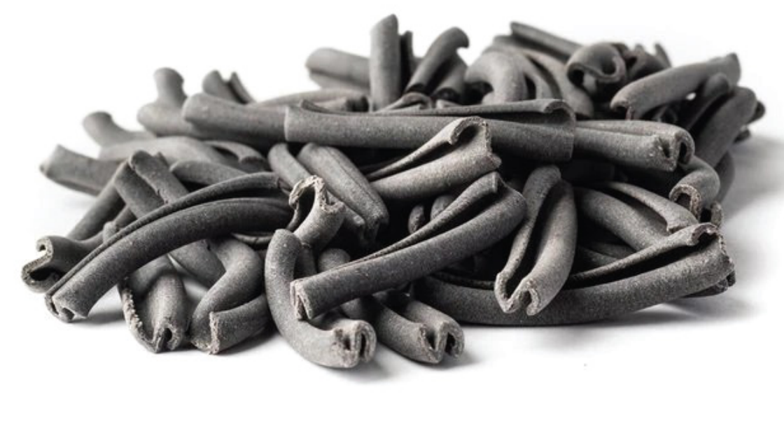
Casarecci Squid ink $13.99 lb