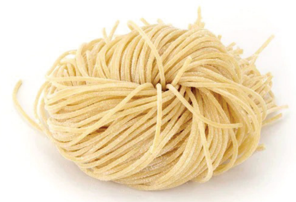
Spaghetti $11.99 lb