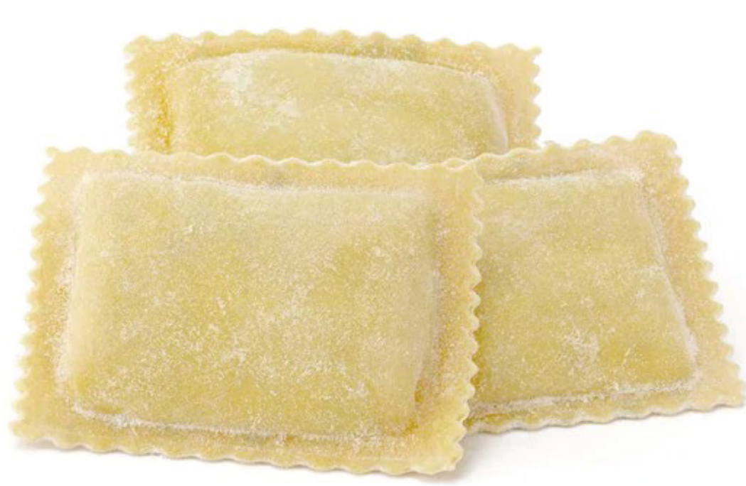
Lobster Mkt $