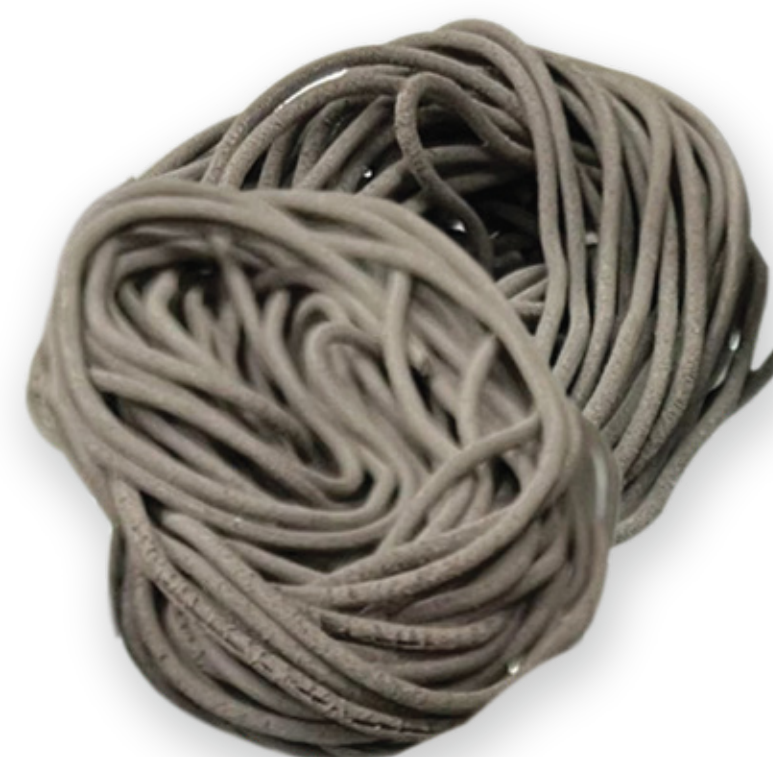
Black Squid Linguine $13.99 lb