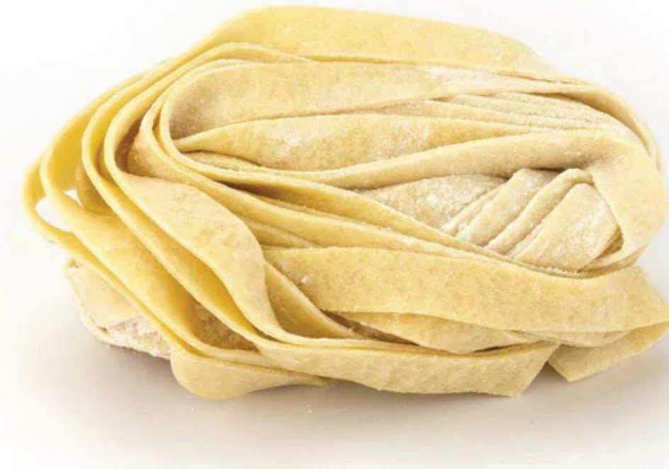
Fettucini $12.99 lb