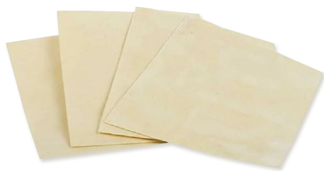
lasagna $12.99 lb