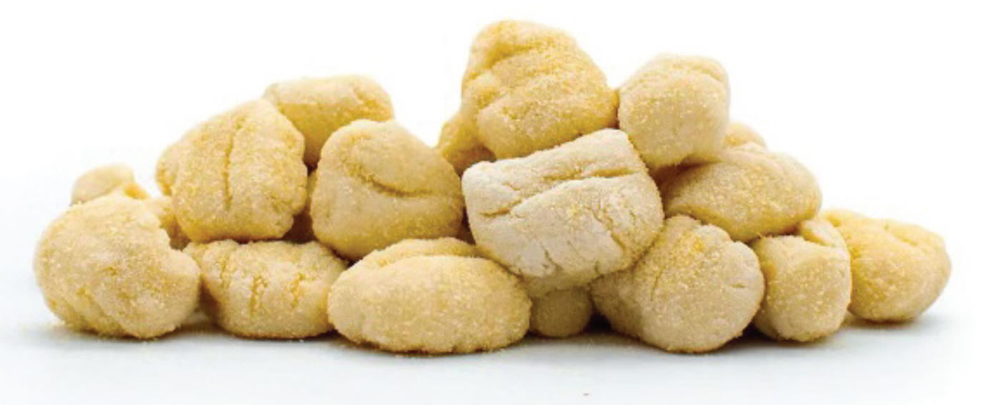
Gnocchi $13.99 lb