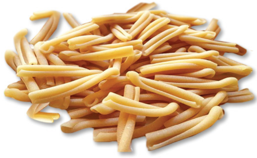
Casarecci $12.99 lb

Ask about other special pasta order requests!